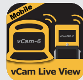
Live View Phone and Tablet App