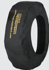
MX Drip bag