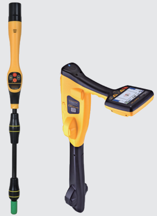
VM-540 and vLoc3-Cam