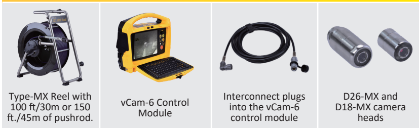
Type-MX Reel with 100 ft/30m or 150 ft./45m of pushrod.

The Type-MX mini-reel can be purchased separately without the control attached to use with the vCam-6 or vCam-5 control modules.