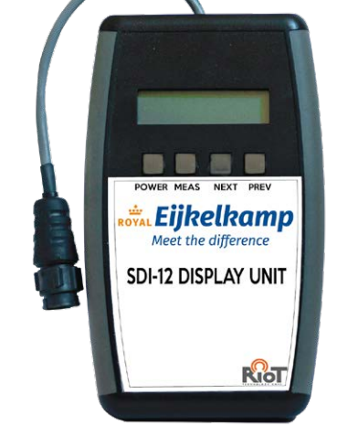
Handheld read-out unit

142830 Read-out unit SDI-12 for reading SDI-12 soil moisture sensors, 9 V battery powered, direct display.