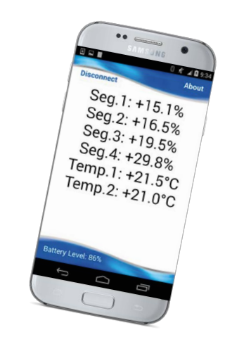
GP Reader app