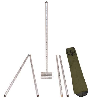
Sediment level stave, standard set

The sediment level stave is part of the standard kit to measure the depth of sediment down to a depth of 4 m. The set contains four extendable measuring rods made of anodised aluminium with threaded connections. The rods are 1 m long and are 25 mm in diameter. The sediment measuring rods are marked every 5 cm. The kit is supplied including a stainless steel sediment grid, core point and carrying bag.