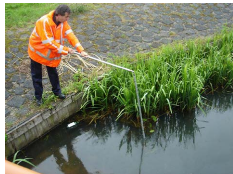
Using the sediment level stave with elbow