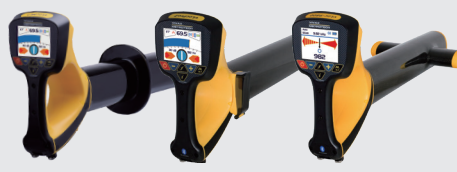
vLoc2 receiver series