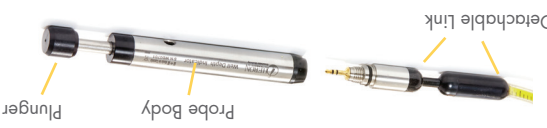
Figure 5 Well Casing Indicator Probe