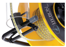
Figure 4 Well Depth Indicator Probe

Figure 3 Hanger to support the meter at the well head. Tape Guide to protect the tape from sharp edges.