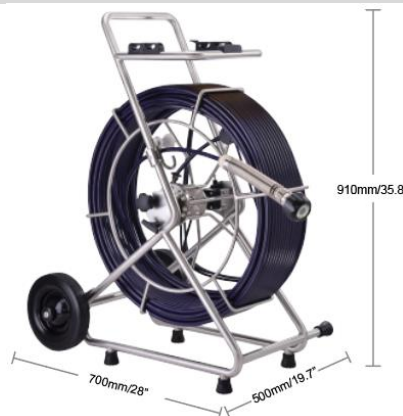
Standard size systems